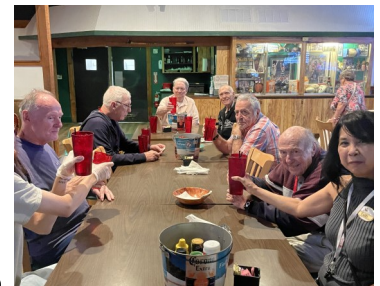
Men's only Bar Outing!

It has been made a tradition that started back in 2023 to have gender specific fun outings here at Aravilla Clearwater. While the men like to go to the bar for a glass of beer, wings, and mozzarella sticks, the ladies prefer to enjoy an authentic English tea party. However, we do have months where the ladies want to go to the bar and even out for shopping!