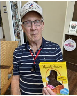
2nd & 3rd Place Winners!