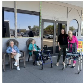
Ladies Only Adventure to the Bar!

It has been made a tradition that started back in 2023 to have gender specific fun outings here at Aravilla Clearwater. While the men like to go to the bar for a glass of beer, wings, and mozzarella sticks, the ladies prefer to enjoy an authentic English tea party. However, we do have months where the ladies want to go to the bar and even out for shopping!