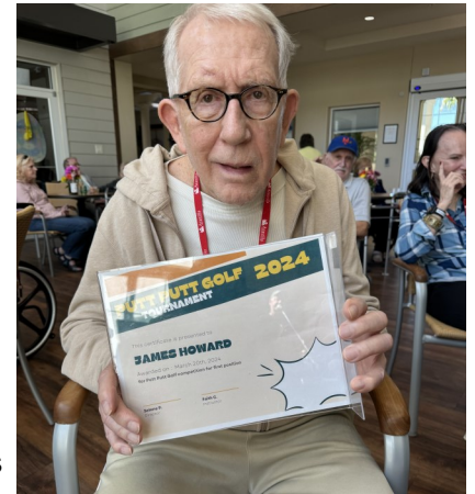
1st Place Putt Putt Golf Tournament Champion!

*Follow our Facebook page; Aravilla Clearwater, for more fun photos of what goes on in our community as an Aravilla Family! You may even find unique photos of your loved ones!