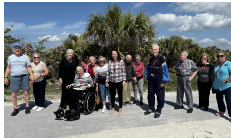
Aravilla Adventure to Honeymoon Island!

A schedule is made to ensure every resident has an opportunity to ride on our bus trips. However, if you or your loved ones see somewhere that you might really enjoy please inform our activities department and arrangements can be made. Family and friends are encouraged to join! Without hesitation, please sign up a week ahead to ensure your seat is reserved for any additional guests.