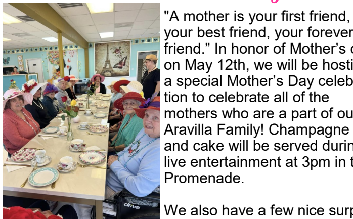
your best friend, your forever friend." In honor of Mother's day on May 12th, we will be hosting a special Mother's Day celebration to celebrate all of the mothers who are a part of our Aravilla Family! Champagne and cake will be served during live entertainment at 3pm in the Promenade.