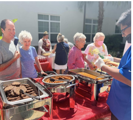
Aravilla Clearwater Memorial Day Cookout!

who can attend. A sign up sheet has been placed at the front desk with the receptionist for anyone who would like to participate. You can also RSVP by calling our main number at 727-260-2826 Monday-Friday between 9am-5pm. We will be grilling outside in the court