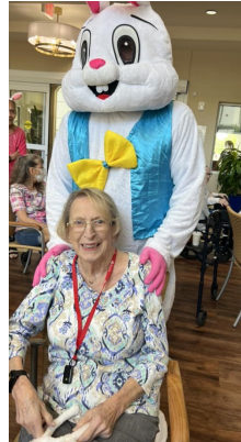
Easter bunny on the loose!

Hello April! The vibrant month of Easter is finally here, and we have an exciting lineup of events just for you! Kicking things off is our Palm Sunday Resident Easter Production—mark your calendars for April 13th! You won't want to miss the heartwarming performances of your loved ones as they sing and entertain you. Join us in the Promenade at 3 PM for an afternoon filled with joy, delicious snacks, and refreshing drinks!