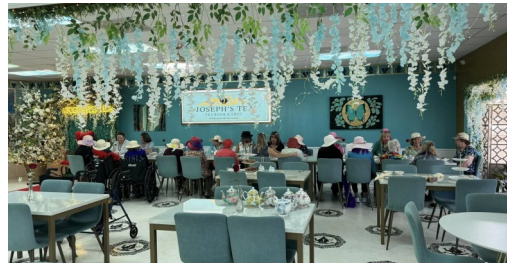
Mothers Day Tea Party!

Mark your calendars and get ready to celebrate with us! We can't wait to see you there!