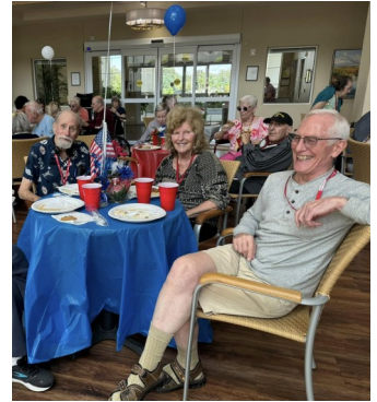
Memorial Day Cookout!